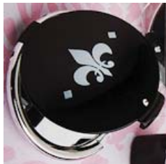
Each R-K girl was given a fleur-de-lis inscribed mirror (shown above).